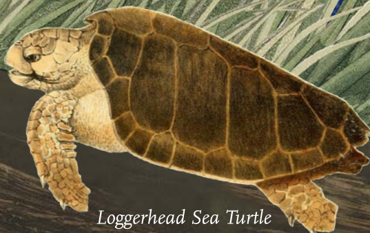
Loggerhead Sea Turtle